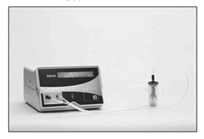
Fig. 1. AKITA® technology with Pari LC Star nebulizer.

Many existing inhalation devices are based on the bolus inhalation technique [3, 25]. For example, MDIs and DPIs are supposed to deliver the aerosol cloud at the beginning of a breath. This leads to a more efficient lung deposition than an inhalation of an aerosol over the entire inspiration because the clean air that follows the aerosol cloud transports the particles deeply into the lungs and extends their pulmonary residence time [2, 3]. Another commercially available system, the AERx® Pulmonary Drug Delivery System of Aradigm (USA) uses a bolus of aerosol particles that can be activated during a certain time point during an inspiration. The bolus is produced by a piston that empties a small liquid reservoir into the inhalation air. Other devices, like the AKITA® Inhalation System (Activaero, Germany; Fig. 1) and the I-neb® AAD® System (Philips-Respironics, Netherlands) use liquid nebulizer systems which are operated only at a certain time during an inhalation cycle and therefore also use the bolus inhalation technique to increase particle deposition in the lung [3].