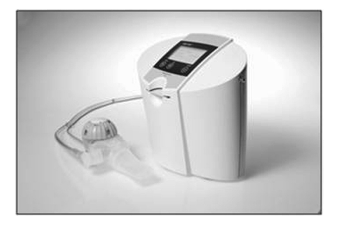
Fig. 2. AKITA®2 system with PARI APIXNEB nebulizer.

Currently, the AKITA<sup>®</sup> technology is the most advanced aerosol delivery technology as it is the only one that actively controls the entire inhalation manoeuvre of the patient. This is done by means of a positive air pressure delivered by a computer controlled compressor which is programmed on base of the patient's individual lung function data. By Activaero's SmartCard technology the lung function data can be submitted