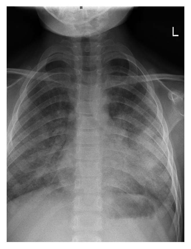
Fig. 2. Posteroanterior chest radiography demonstrating pulmonary infiltrations during an acute phase of Idiopathic pulmonary hemosiderosis.

lar lavage fluid revealed the presence of many hemosiderin-laden macrophages. Lung function tests were within the normal range. Other causes of secondary pulmonary hemosiderosis, including glomerular and hemolytic syndromes, hemorrhagic purpura, and cardiac, vascular, rheumatoid, and immunologic disorders were excluded. The diagnosis of IPH was made and therapy with glucocorticoids was initiated with partial and transient response. In order to exclude celiac disease serum markers of this condition were also investigated. Antiendomysial serum IgAEmA was negative.