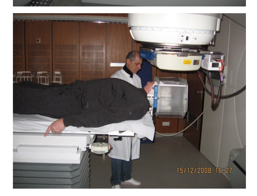
Fig. 3. Patient undergoing stereotactic radiosurgery.